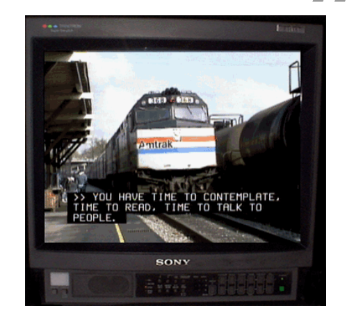
TV WITH CAPTIONING